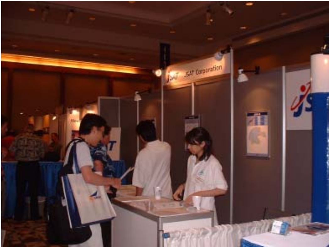
Fig 3 Exhibition Booth of JSAT Corporation