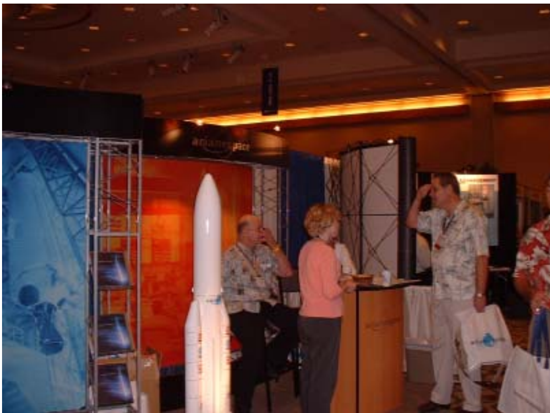
Fig 4 Exhibition Booth of Ariane Space