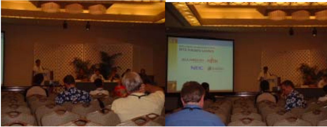
Fig 2 Conference place of “An Analysis of the Satellite Industry’s New Reality”