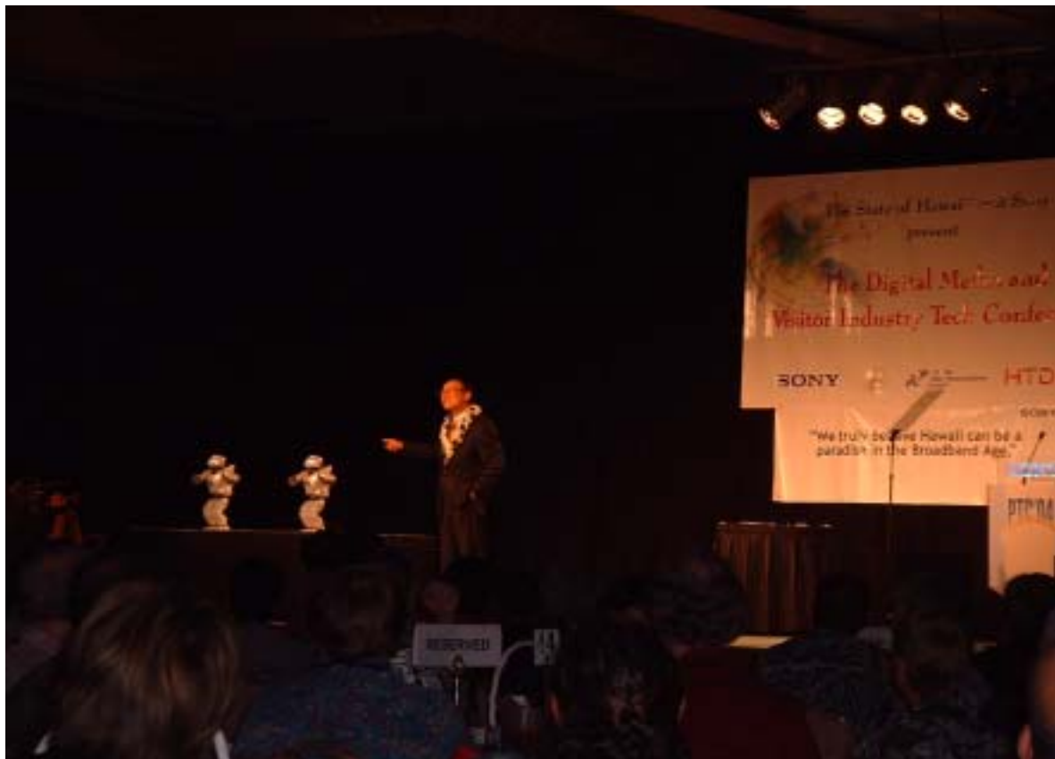
Fig 1 Luncheon Session by Sony Corporation

It is impressed that technical sessions like “Digital Media Technology”, “Visitor Industry Technology” led by Sonny corporation are popular in the conference floor. Especially, the attraction by the man-made robotics by Sonny Corporation gathered a lot of audience in lunch session which is shown in Figure-1 Now it is time to go Digital Media from Telecommunications for PTC.