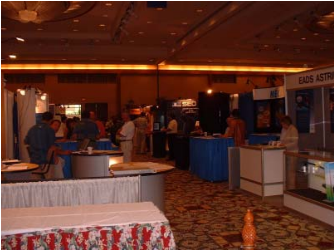
Fig- 5 Exhibition