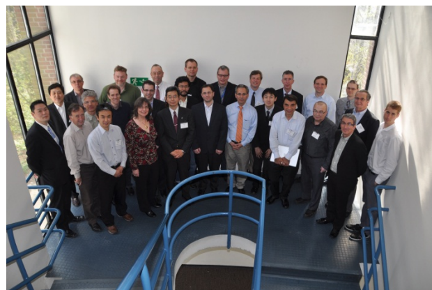
Fig. 2 First SLS-OPT Meeting

The first face to face meeting of SLS-OPT took place during March 31 to April 2 in the CCSDS 2014 spring meeting period. Space agencies of the US, China, Europe and Russia as well as a number of related companies participated in the meeting.