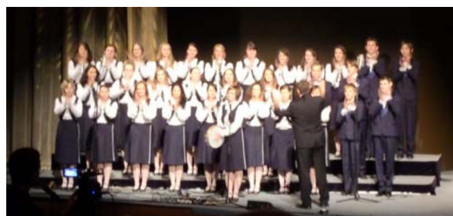
Fig. 3. Entertaining performance in IAC2010 opening ceremony