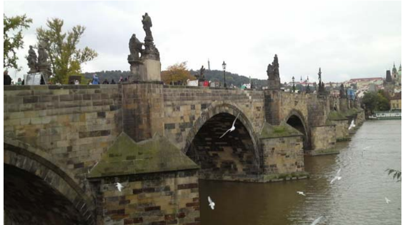
Fig. 6. Famous Charles bridge (Karlův) in Prague