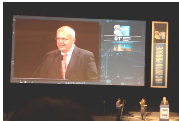
Fig. 2. Speech by Czech Cosmonaut V. Remek