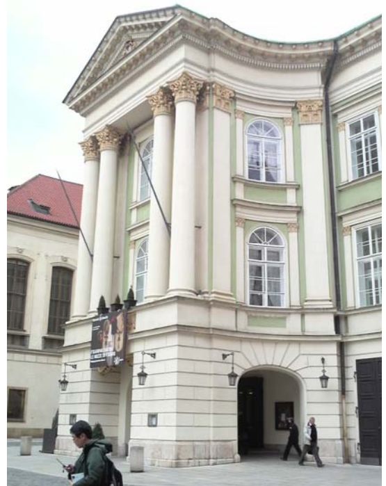
Fig. 7. Estate Theatre (Stavovské divadlo)

John Hopkins University presented the experimental results of determining the spin axis for the NASA Radiation Belt Storm Probes (RBSP) mission by using RF Doppler signals re-