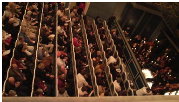
Fig. 8. Audience of “Don Giovanni” in the Estate Theatre