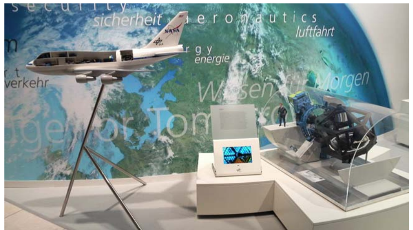
Fig. 4. Scene from Exhibition (DLR's booth)

National Institute of Information and Communications Technology (NICT) from Japan made a presentation on the results of the optical communications experiments between OICETS and the world's four OGSs. The agency developed a common analysis program to analyze the propagation data obtained at