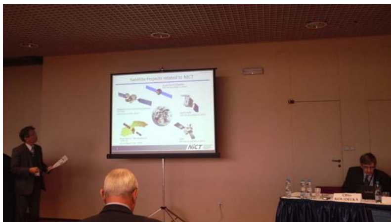
Fig. 5. Scene of B2.2 Session.

NICT made a presentation on survivability application demonstrations via Wideband InterNetworking engineering test and Demonstration Satellite (WINDS). In the presentation, discussed are various experiments for the survivability applications in a disaster, such as helicopter satellite communications systems, wireless ad-hoc connections using the IP phone, and airborne synthetic aperture radar (SAR) data connections. The agency carried out the demonstration of disaster communications combined with the IP network on the ground, which successfully resulted in less than 1 second delay in reply talk maintaining a good voice quality, and also the good performance of video data transmission. Fig. 5 shows the B2.2 Session. LIQUIFER Systems Group from Australia reported on analysis of the Chinese and Indian satcom markets. It observed that satcom applications in China are strongly influenced by the government and the military, and direct satellite reception to home TV is generally forbidden. Furthermore, it referred to necessary provisions of multiple channels even for a single satellite to cope with different languages spoken in the country, where many ethnic groups exist and the domestic demand seems greatly upward.