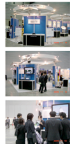
Exhibit of AIAA-JFSC Corner at MWE2005 (Microwave Exhibition) held in Yokohama on November 9-11, 2005

*Asia Pacific Satellite Communications Council, Korea