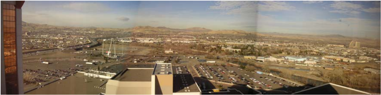
Reno outlook without snow (photoed from Reno Hilton Hotel on January 12, 2006).