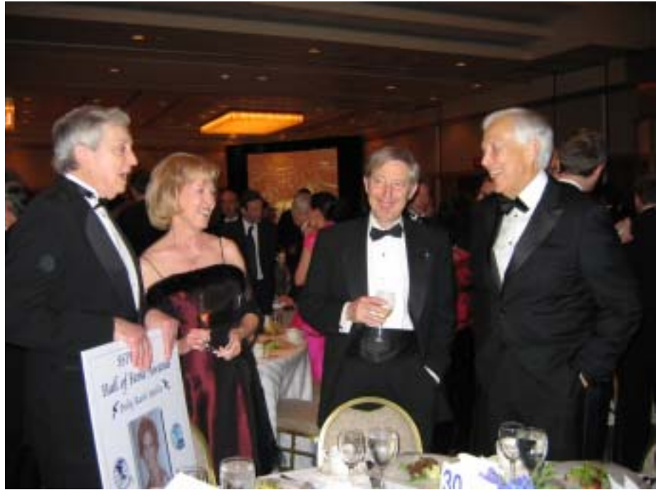
Fig 6 SSPI Gala- 1