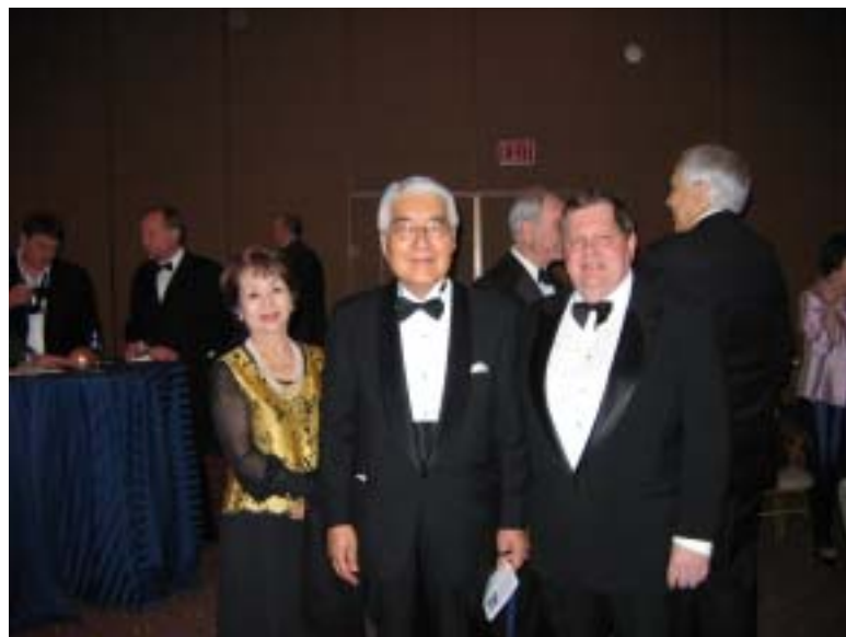
Fig. 5 Cocktail Party at Award Ceremony