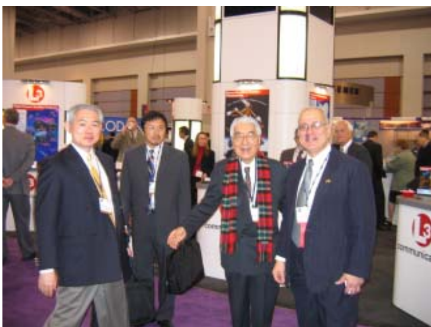
Fig 9 Exhibition Hall-2