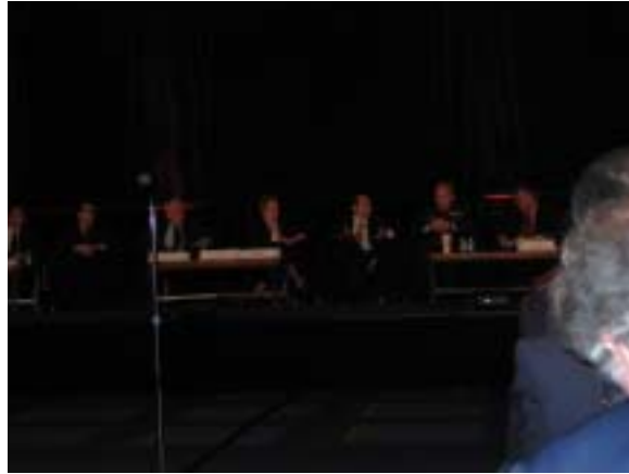
Fig 2 Military Satcom Forum