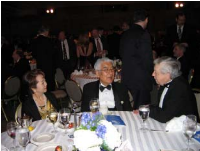
Fig 7 SSPI Gala- 2